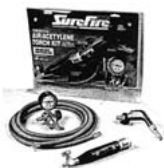
AA 1000.25 KIT