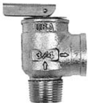
10-407 & 10-417